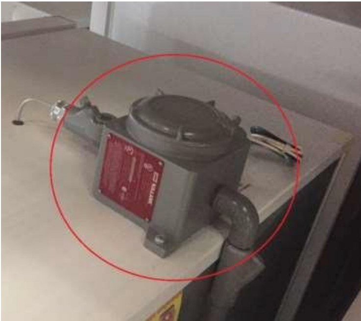
Mechanical Temperature Controller – located in the rear top location of refrigerator or freezer, inside of the metal enclosure.

After making an adjustment, please allow 8 hours' operation before making a new adjustment.